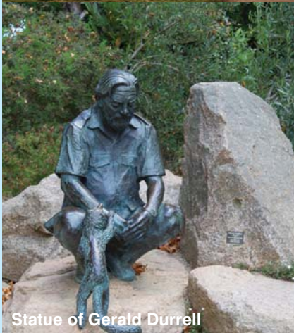
Statue of Gerald Durrell