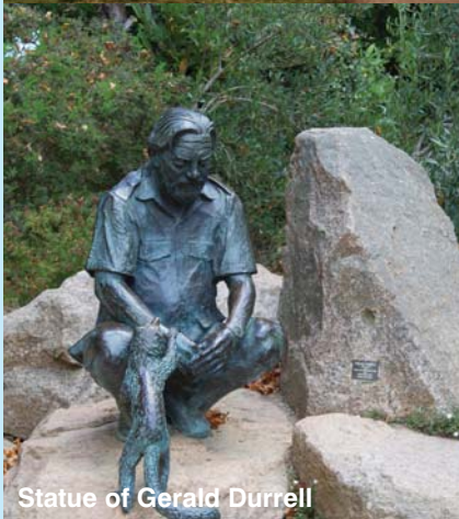
Statue of Gerald Durrell