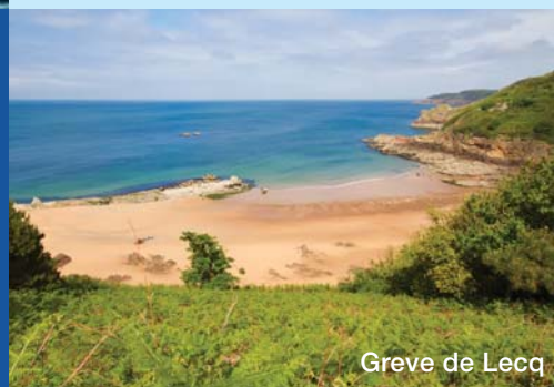
Greve de Lecq

Any air holidays and flights in this brochure are ATOL protected by the Civil Aviation Authority. Tailored Travel's ATOL number is 5605