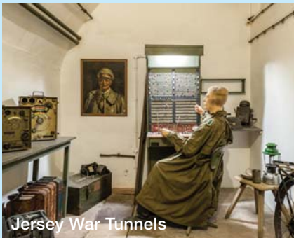
Jersey War Tunnels