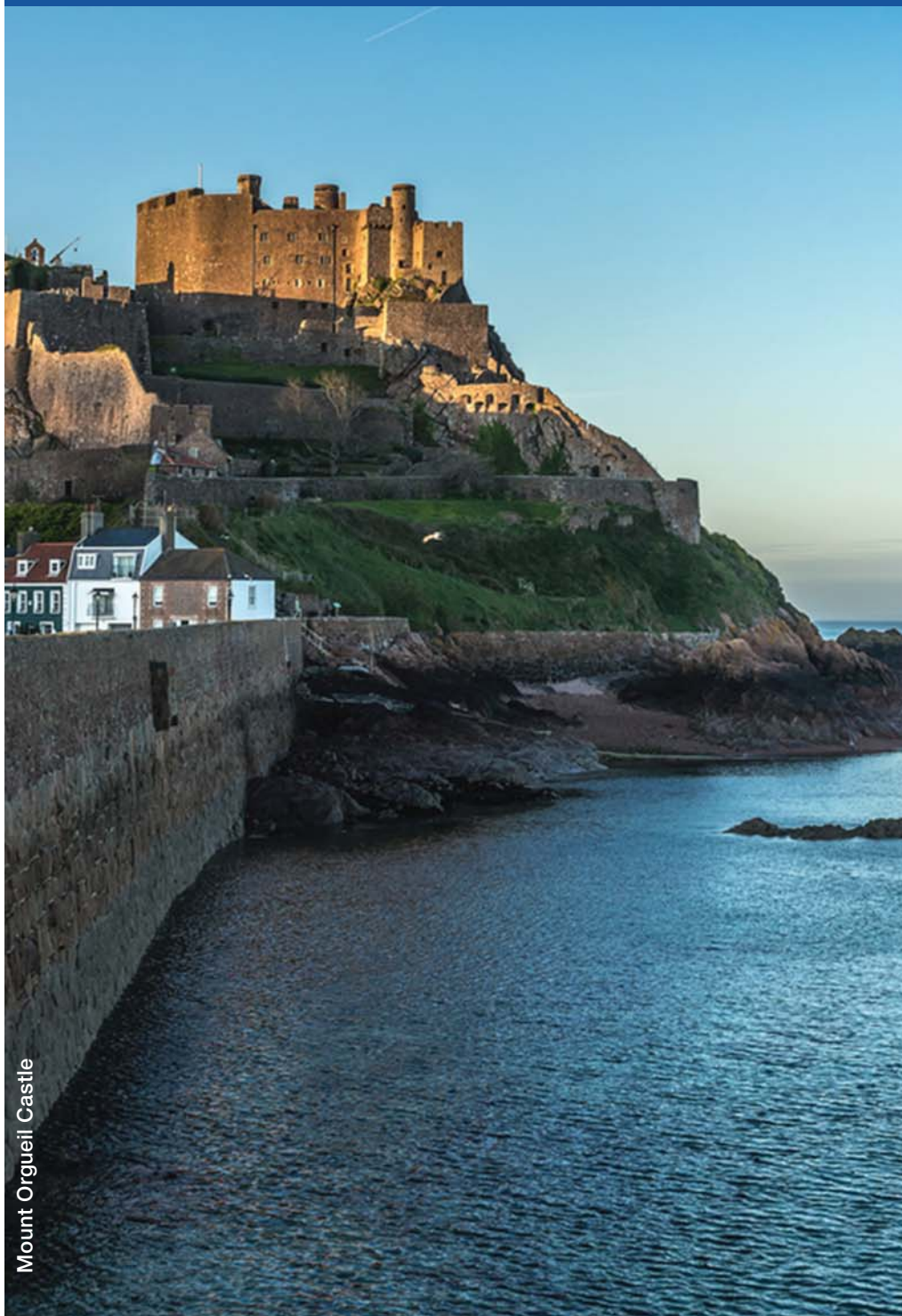
Mount Orgueil Castle